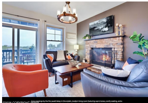
©2026 COPYRIGHT R/MAR by the finest Real Estate in this stylish, modern living room featuring warm tones, comfy seating, and a

for your FREE & INSTANT home value estimate